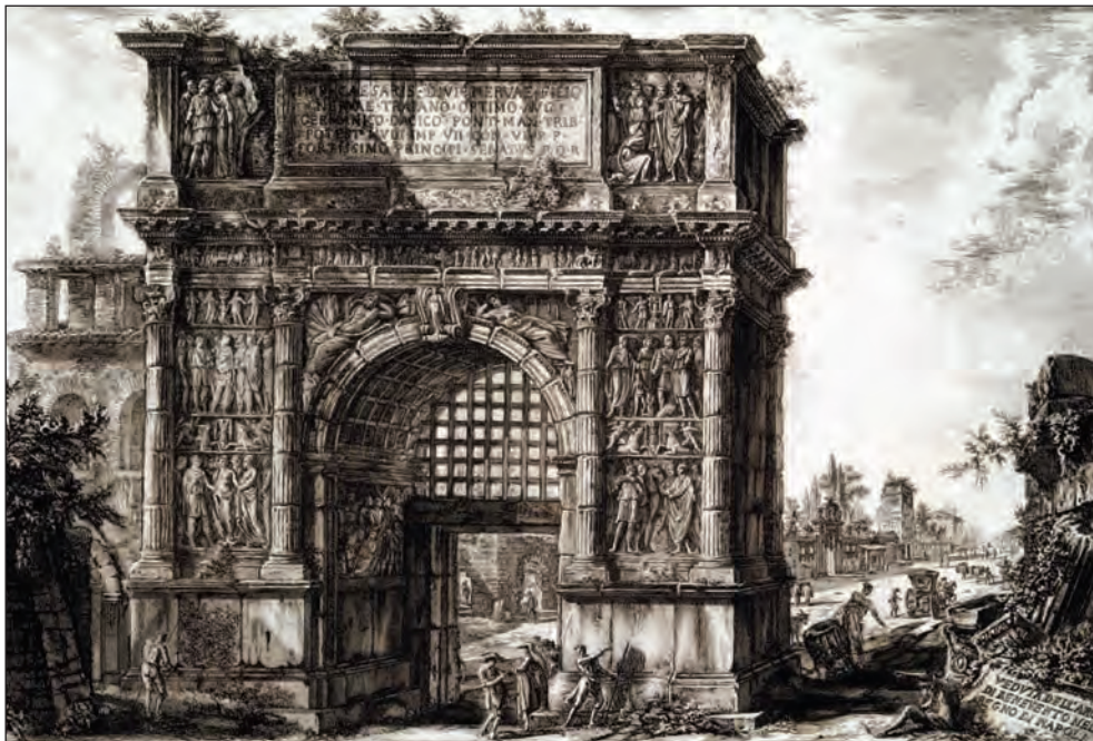
Above: ‘View of the Arch of Beneventum in the Kingdom of Naples’ ( Veduta del L’Arco di Venevento nel Regno di Napoli ), in Volume 2 of Vedute di Roma . (Library no. 558208)

“In Piranesi’s time Rome was crumbling and overgrown with creepers and wild flowers.”