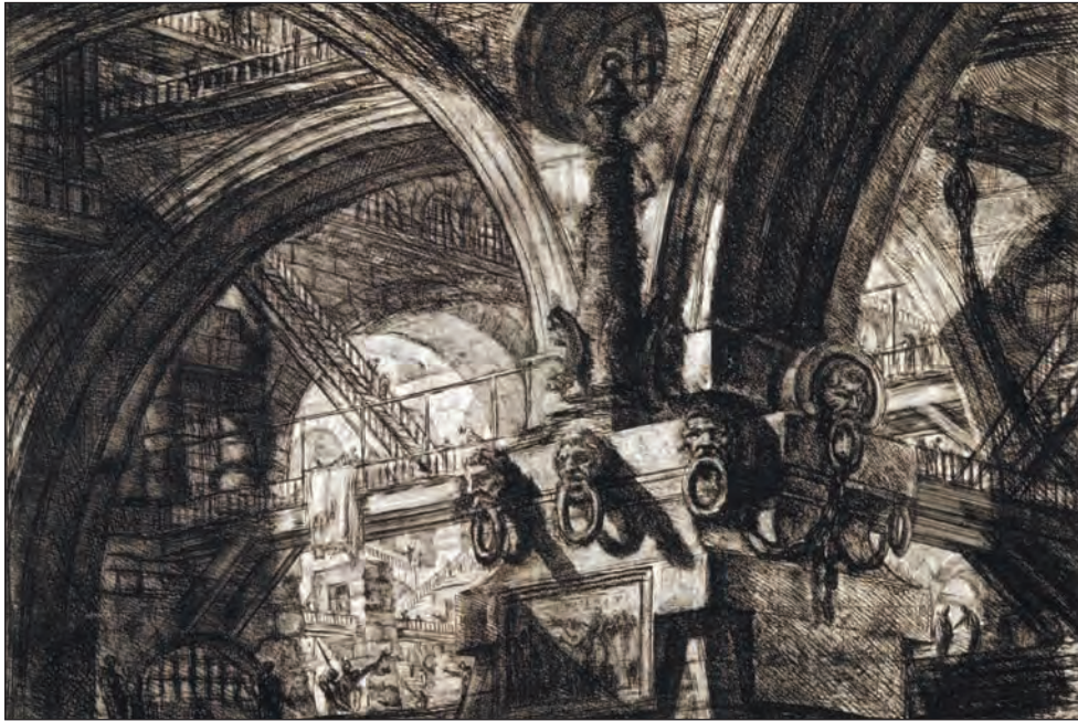
Later state print of one of Piranesi's series of imaginary prisons, Carceri d'invenzione , in the second section of the combination volume Opere Varie di Architetture . (Library no. 523222)

etched surfaces of the prints, and were bound in similar red, blue, brown or green marbled or spotted paper boards with leather spines, and frequently with one of the various binder's tickets by Tessier. 9