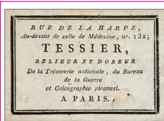
This and other Tessier binder's tickets have been useful in dating some of the University Library's Piranesi volumes (this one is inside the front cover of Le Antichita Romane , Volume 2).

volumes, as the dates found on the title and text pages in each volume are not reliable guides. Although the volumes sold relatively well in Piranesi's time, they were expensive to produce and could take years to make a profit. So Piranesi tended to wait until he had collected enough subscriptions or found a patron for the initial grant before publishing. He would, however, print large quantities of the title and text pages so as to have a stockpile to draw on when volumes were put together over subsequent years. Untangling which editions the University Library holds was going to be even more difficult than I had anticipated. Rather than referring to the printed dates I turned my attention instead to the inside front cover of the volumes, some of which contain a binder's ticket for a Paris firm called Tessier, with an address of Rue de la Harpe.