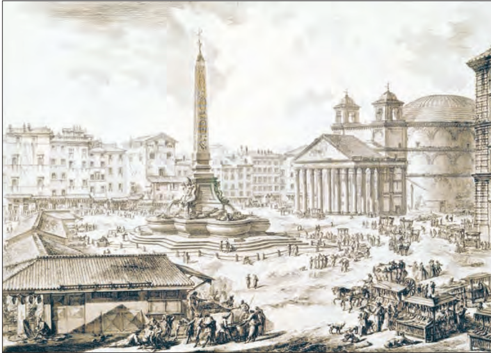
‘View of the Piazza della Rotonda ( Veduta della Piazza della Rotonda ) in Volume 1 of Vedute di Roma . Note the market stalls crowding the piazza. (Library no. 558207)