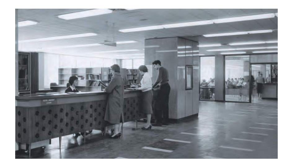
Baillieu Library loans counter, September 1959, photographic print, 24.7 x 19.7 cm.

years gone by. This furniture was also seen in the exhibition.